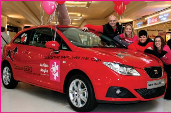
SEAT and Autism Anglia staff at the Meadows Shopping Centre