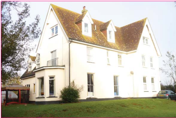
Peldon Old Rectory

Peldon Old Rectory is a three storey Victorian building and offers accommodation for eleven adults. All service users have their own private bedrooms and the house is set within large developed gardens which are used for leisure, recreation and gardening. The gardens contain greenhouses, a swimming pool, a workshop, fruit, vegetables and flowers.