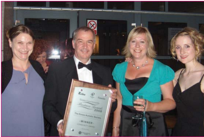
Essex Business Awards 2008

This high standing and regard in the community has also been reflected by the winning of many awards during the year. We have won two High Sheriffs of Essex Awards 'In recognition of valuable service to community safety in the County. This award also recognises the appreciation of the people of Essex for this contribution in enhancing the life of the community'; the Newsquest Group 'Essex Countywide Business Community Award 2008'; the Essex Chronicle Media Group 'Best Business in the Community Award 2008'; and the Essex County Council Millennium Fund Award 2008 'In recognition of the commitment and dedication to improve the lives of people in their community.'