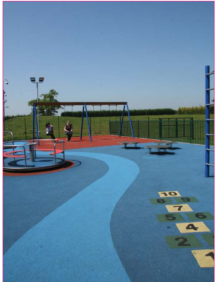
Play area Doucecroft School

The Doucecroft School Services offer post 16 education on a separate site in Kelvedon and within the school site at Eight Ash Green. The individual nature, locations and characters of the two establishments facilitate different opportunities for students in terms of the on-site facilities, the curriculum, the age range of students and access to the community and transport links.